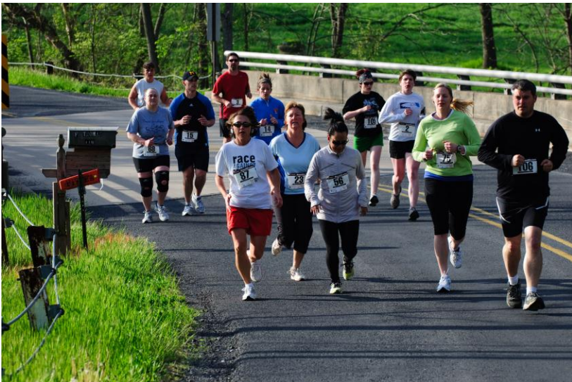
A group of runners round a bend in the 5-mile course during the 2010 race.