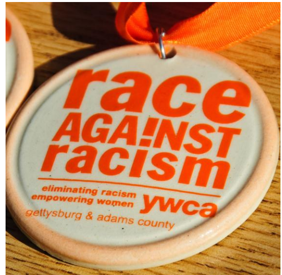
Winners in each age group receive a medal.

YWCA Gettysburg & Adams County 909 Fairfield Road Gettysburg, PA 17325 717-334-9171 ywcagettsburg.org